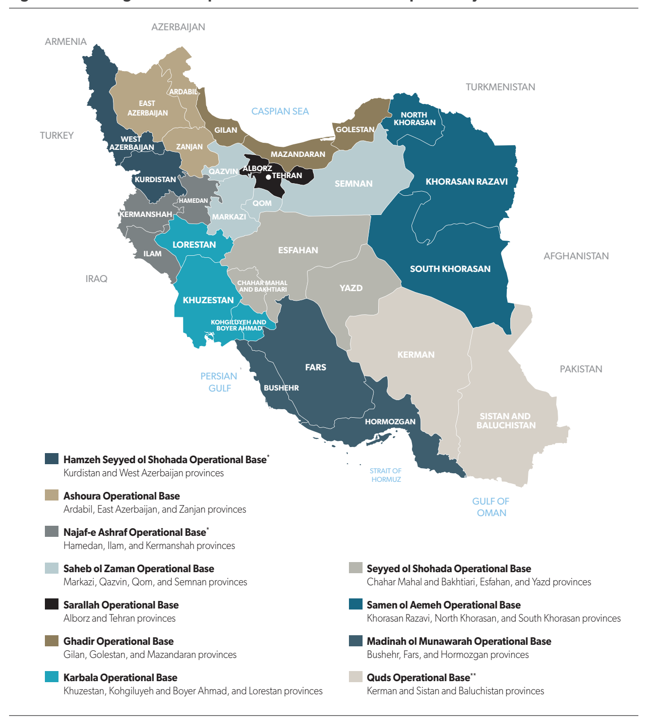
Figure 2. IRGC Regional Headquarters' Assessed Areas of Responsibility

Note: *The Hamzeh Seyyed ol Shohada and Najaf-e Ashraf operational bases both cover portions of Kermanshah province. It is unclear how the province is divided between the two headquarters. Kermanshah is thus listed under the West Region section of this order of battle solely because the Najaf-e Ashraf Operational Base is likely located in the province—whereas Hamzeh Seyyed ol Shohada is located in West Azerbaijan province. **The Quds Operational Base controls Sistan and Baluchistan Province and some regions in Hormozgan, South Khorasan, and Kerman provinces. The Madinah ol Munawarah Operational Base likely controls the majority of Hormozgan; however, the Samen ol Aemeh Operational Base also likely does in South Khorasan. The Quds Operational Base controls areas around Bam, Fahraj, Ghaleh Ganj, Jiro, Kahnouj, and Narmashir counties in Kerman. It is unclear to which base the remainder of Kerman Province belongs. Source: Authors.