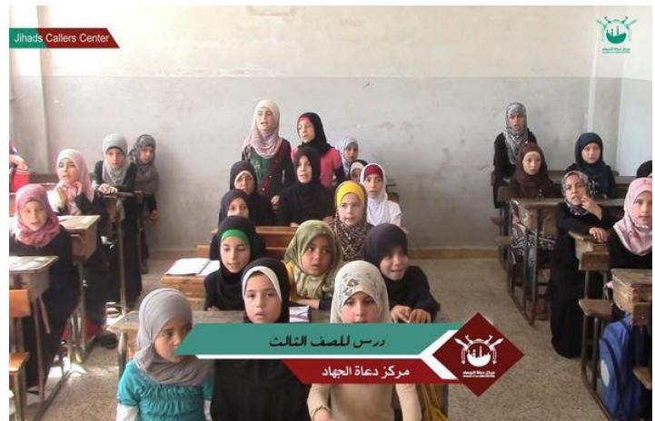
(Left) The photo shows a Shari'a class for women held by the Aisha Mother of Believers Institute, operated by Jabhat al Nusra's Jihad Callers Center in northwestern Syria. (Right) The photo shows Shari'a classes for young girls held by Jabhat al Nusra's Jihad Callers Center in northwestern Syria.